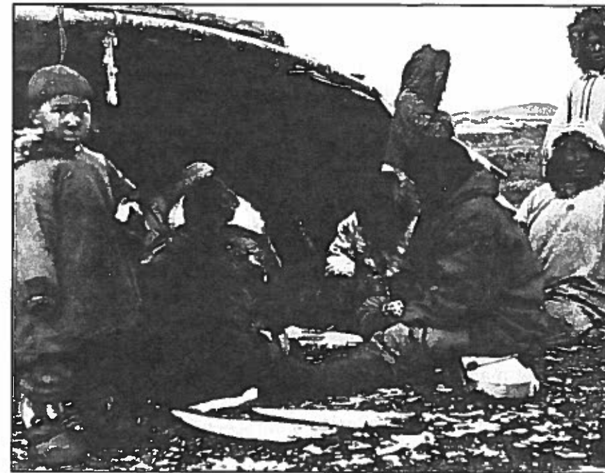
Gambling was a favorite pastime of many Native men. These Inupiat men are gambling for walrus tusks in the shadow of an umiak. (Anchorage Museum of History and Art)

The Inupiat elders have returned the frozen family to their graves, but the misfortune of those ancients has resulted in fascinating scientific findings concerning life in the high arctic several centuries ago.