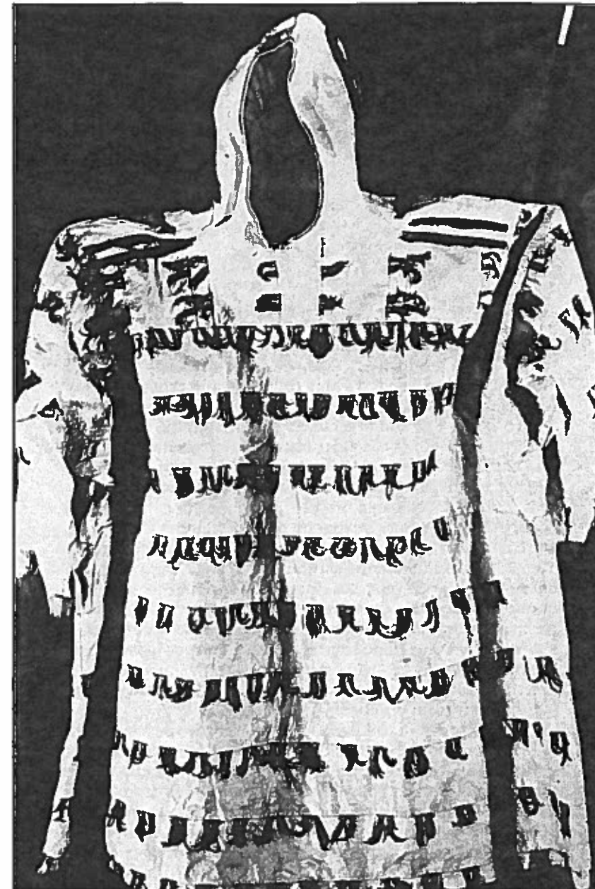
Waterproof outerwear, probably made from walrus intestines and decorated with cormorant feathers.

Several devastating epidemics swept through the coastal villages in the 1870s and 1880s. After the decline of the market for whale products in the 1890s, the remaining Inupiat were left virtually to themselves until the second half of the 20th century.