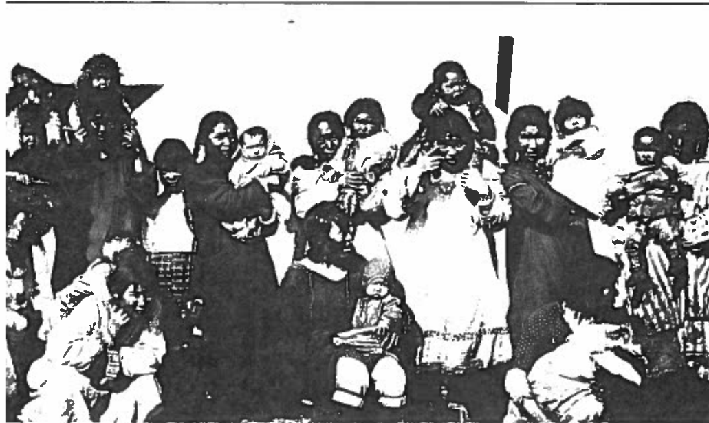
Eskimo women and children, Teller, 1906.

could include short-term exchanges of spouses as part of the generosity between the two families. Inupiat who had the same name also recognized a relationship between each other. Finally, adoption was quite common and also served to establish a special relationship between people.