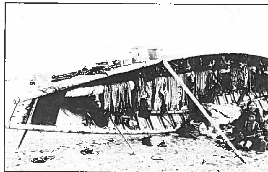
Umiaks could be used for many purposes other than travel. This one is helping to dry laundry. When overturned, they could provide emergency shelter from storms which develop quickly over the Bering Sea.

Trade was an important aspect of Inupiat life, particularly after establishment of Russian outposts in Siberia in the late 17th century made tobacco and other European goods available through exchange with the Chukchi. More traditional trade, such as that carried out in the trading partnerships, brought interior and coastal peoples together for the exchange of products. Seal oil and muktuk (whale skin) were prized by interior peoples who provided caribou and other fur skins in exchange for them. Trade fairs, attended by people from many areas, were conducted in mid-summer at several locations.