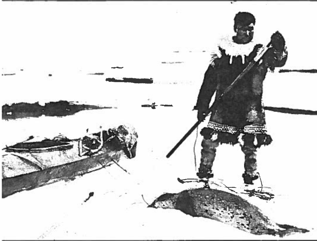
The Tareumiut, or "people of the sea," developed ingenious tools and methods for hunting seals, whales and other marine mammals. During the late 19th century, their resourcefulness and generosity saved many Yankee whalers whose vessels were trapped in the grip of the Arctic ice.